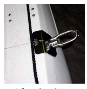
2. Long loop, for stern