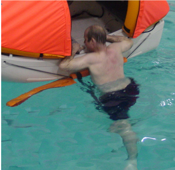
Climbing in, using the MFC

IMPORTANT: Practice climbing into the Pudgy before an emergency arises.